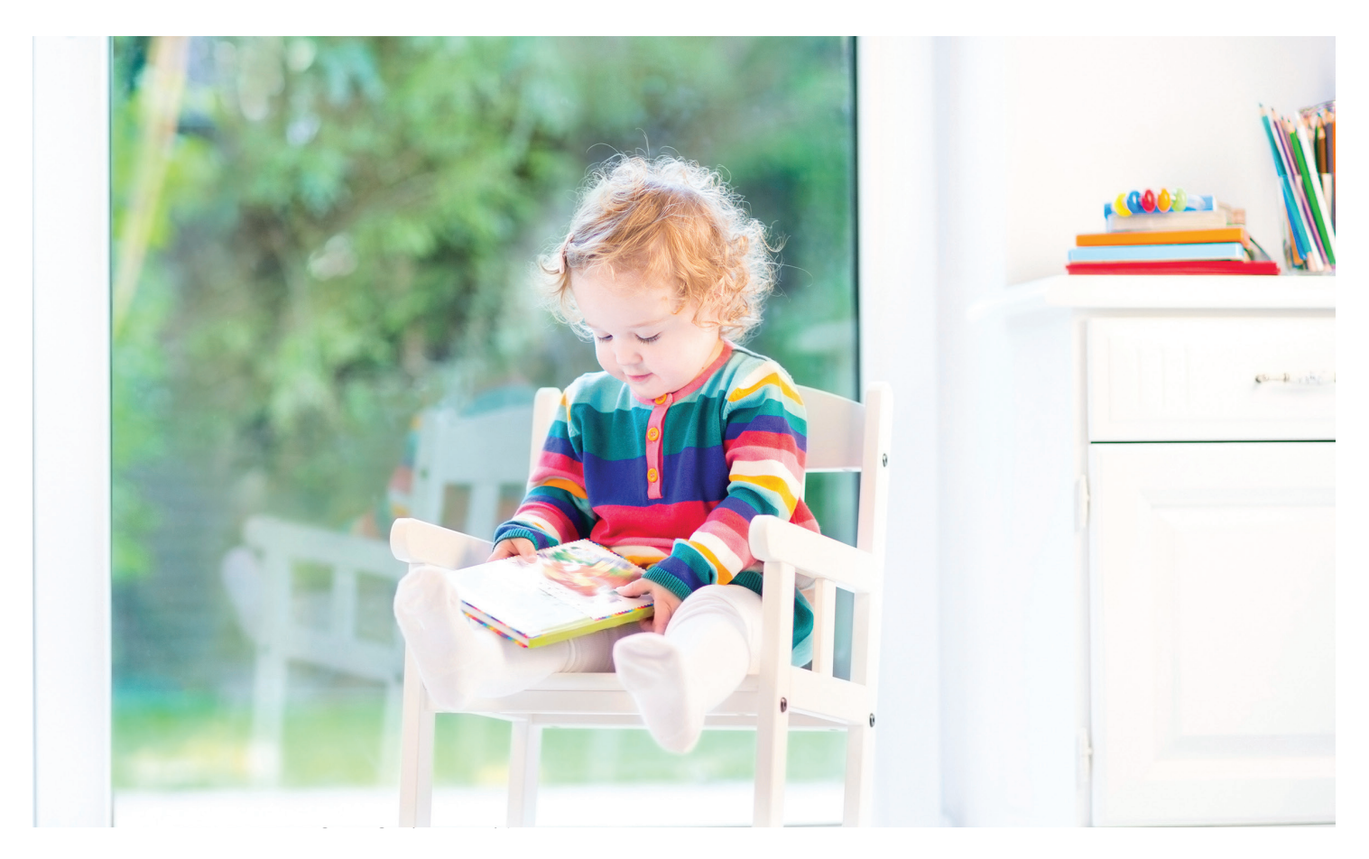
(Adapted from Lappin, S. (2014, Oct. 9). Using "Time Out" to Practice Calming Down in the Classroom (or at Home). Sound Discipline: Making Connections that Matter https://sounddiscipline. wordpress.com/2014/10/09/using-time-out-to-practice-calming-down-in-the-classroom-or-at-home/)

Once both you and the child have calmed down, you can work on solving the problem that created the issue to begin with, if needed. If the problem does not need to be addressed further, the best thing to do is just move on rather than bringing it up again.